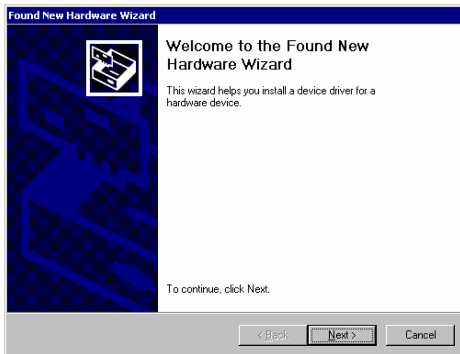
Figure 1.1. Wizard Opening Screen