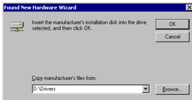
Figure 1.4. Wizard Insert Drivers Request Window