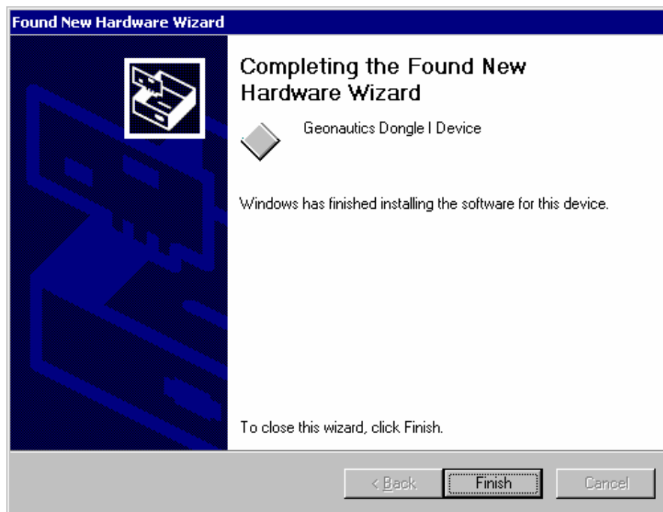
Figure 1.6. Wizard Completion Screen

The driver should now be installing. A final dialog box should be displayed with 'Geonautics Dongle I Device' clearly written at the top of the dialog. The dialog should state that 'Windows has finished installing the software for: Geonautics Dongle I Device'.