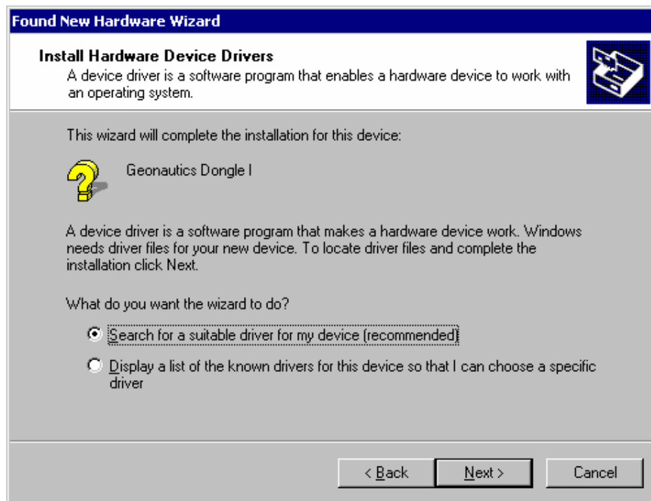
Figure 1.2. Wizard Driver Main Options Screen